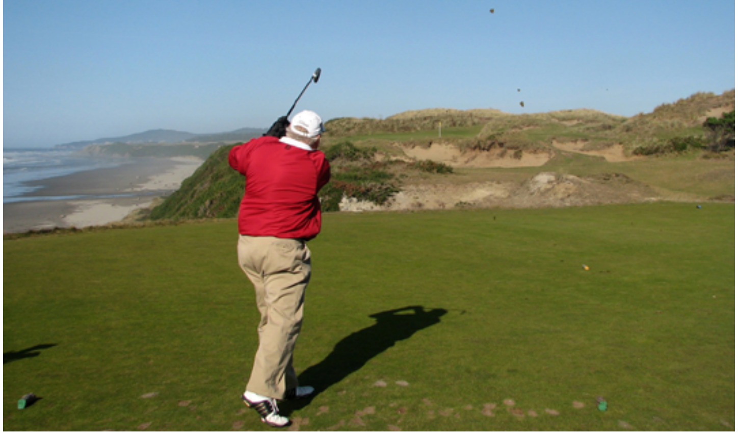
A putting green deemed firmer than normal will impact Course Rating<sup>™</sup> and Slope Rating<sup>®</sup> more than a fast surface because other obstacle factors will be affected, such as green target, rough and recoverability, and bunkers.

Course Rating<sup>™</sup> and Slope Rating® with putting green speeds maintained at 9 feet 6 inches versus 10 feet 6 inches — To illustrate how putting green speed may impact the Course Rating<sup>™</sup> and Slope Rating<sup>®</sup>, a simulation from XYZ Golf Club is provided. The putting greens at XYZ Golf Club have a balance of relatively flat to moderately sloped putting greens, which is consistent with what course raters find at golf courses across the country, according to Scott Hovde, assistant director of the USGA Handicap and Course Rating Administration. The putting green speed at XYZ Golf Club is normally maintained to 9 feet 6 inches, with a Course Rating<sup>™</sup> of 70.0 and a Slope Rating® of 128. If the putting green speeds are increased to 10 feet 6 inches for daily play, the Course Rating<sup>™</sup> would change to 70.2 and the Slope Rating® to 130. A slightly