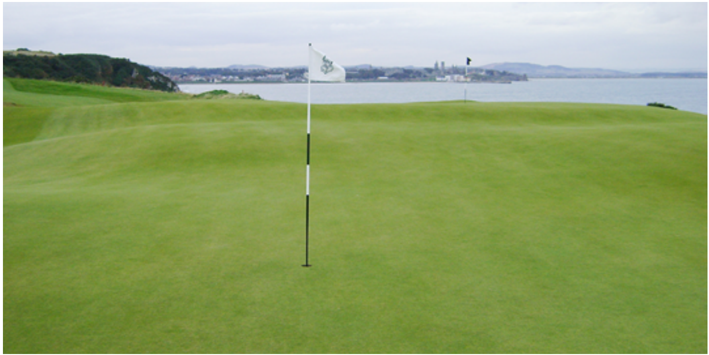
Putting green contours and speed have an impact on USGA Course Rating<sup>™</sup> and Slope Rating<sup>®</sup>. Severe contours and fast green speeds receive a higher obstacle value compared to relatively flat putting greens maintained at moderate speeds.

he U.S. Open Championship has long been known for being a rigorous test of golf with difficult playing conditions that challenge a player's shot-making abilities and mental toughness. Firm, fast putting greens with challenging but fair hole locations are a key aspect of course setup for every U.S. Open. Putting green setup during the U.S. Open, which focuses on firmness and speed, is determined by careful analysis of putting green contours on each hole i.e., long, medium, short iron, elevated surface, etc. — to various hole locations (Davis, 2007). Therefore, U.S. Open